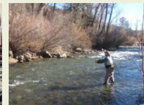
Blue River Silverthorne, Colorado