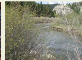
Eleven Mile Canyon Colorado