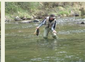
Eleven Mile Canyon Colorado

Fly fishing requires being fully present. It gives you the opportunity to set out on an amazing adventure that takes you from the hustle and bustle of life and provides an avenue for solitude, exploration, reflection, and transformation.