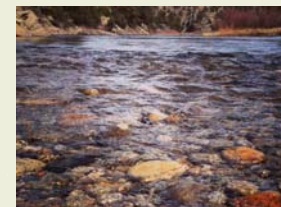
Arkansas River Buena Vista, Colorado

Each week we will explore an area of fly fishing and see how it helps shape our lives and speak into our hearts. We will explore life lessons through both the good and bad that happen on the river.