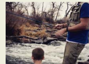
South Platte River Denver, Colorado

This price covers the six weekly teaching and reflection sessions. You will also have to personally obtain a Colorado fishing license. There is no cost for the fishing trip and no tips will be accepted. This is not a guided trip but an adventure. We will help each other grow in our skills.