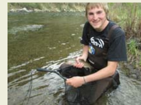
Eleven Mile Canyon Colorado