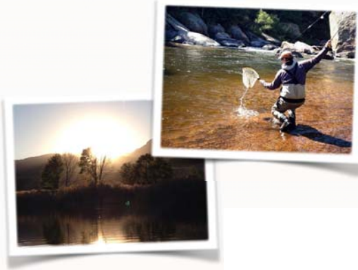
Left: Chatfield State Park. Right: Cheeseman Canyon